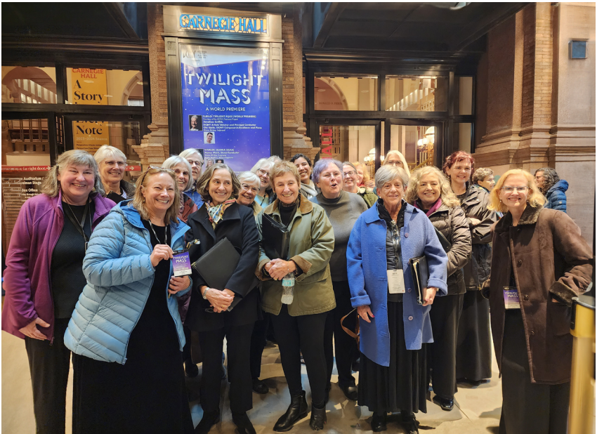
CWC members sing at Carnegie Hall

Please let us know you are coming: manager@concordwomenschorus.org . And check out our website for more information.